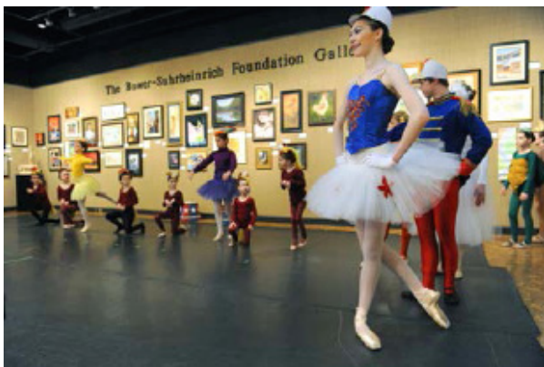
Children's Center for Dance Education, Brown Bag Performance, 2011

The Arts Council awards over $360,000 in grants each year to provide arts education programming for area K-12 students. Funding in 2012 has been used for art supplies in schools, youth theater, vocal and instrumental concerts, field trips, arts competitions, and art fairs. Grants are written to public, private, parochial, and charter schools, as well as to organizations that administer arts programming as part of their mission.